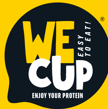
Display Box QET